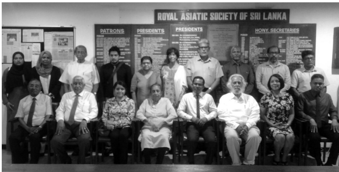
Maldivian delegation with the RASSL representatives