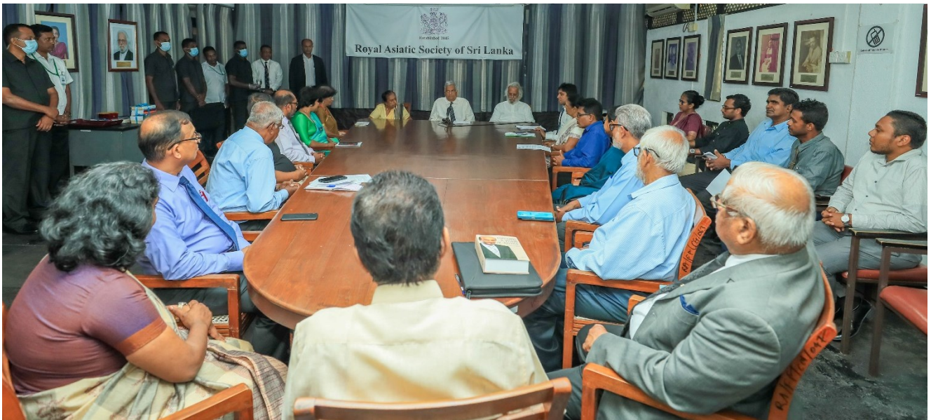
The RASSL Council meeting presided by the President H.E. Ranil Wickremesinghe

If undelivered, please return to Royal Asiatic Society of Sri Lanka 96, Ananda Coomaraswamy Mw. Colombo 7