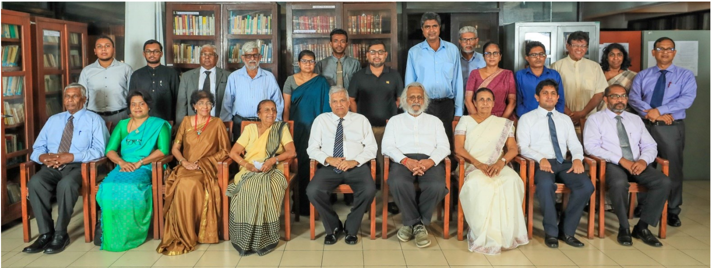
RASSL Council with President Ranil Wickremesinghe

His Excellency the President Ranil Wickremesinghe's official visit to the Royal Asiatic Society office on 27 th of April 2023 was an important event of the recent history of the Society. It was the first visit made by a patron of the Society since late President J.R Jayewardene, who visited the Royal Asiatic Society of Sri Lanka in 1985. By the Constitution of the Royal Asiatic Society of Sri Lanka (RASSL), the Head of the State is the Patron of the Society and the visit of President Ranil Wickremesinghe is a gesture that stands along with that distinguished tradition.