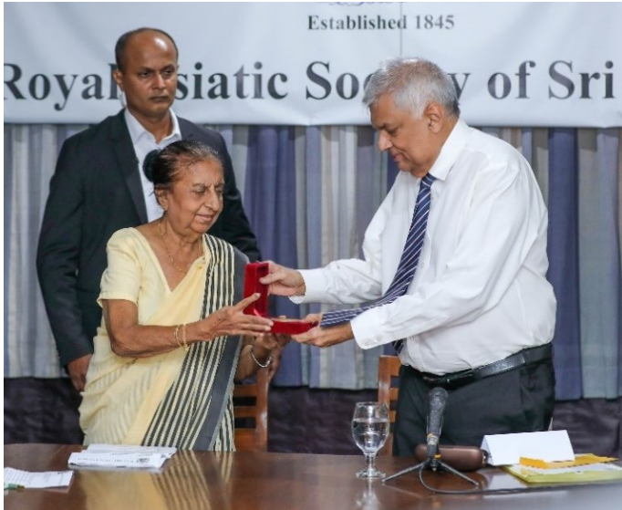
President of the RASSL presents the RASSL 175 Anniversary Medal to H.E. Ranil Wickremesinghe