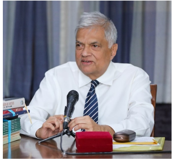
H.E. Ranil Wickremesinghe addresses the Council